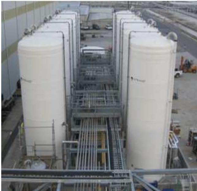
Association of Business in Industry (LABI).